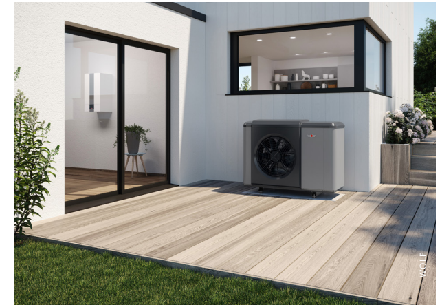
Geothermal and air source 2019 and 2020 market shares of the water-borne heat pump segment in the EU*

the estimate renewable energy provided by heat pumps in the EU in 2020